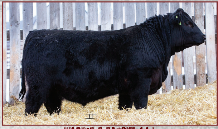
WARD'S C CAPONE 44J