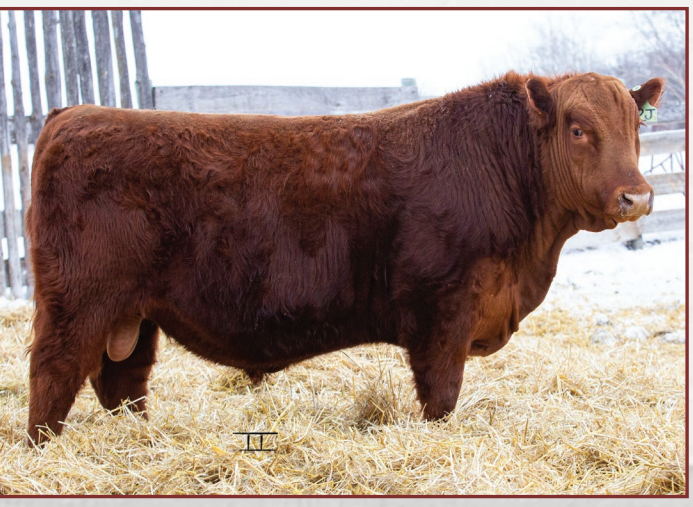
RED WARD'S JAB 12J

Dam 621D is a solid cow, moderate and deep with a different twist in her pedigree.