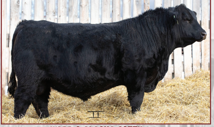
WARD'S ALASKA 2055H