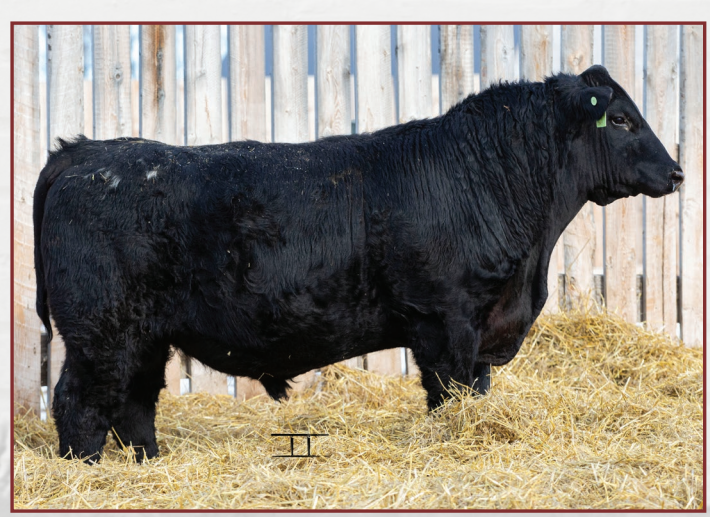
WARD'S ALASKA 2019H