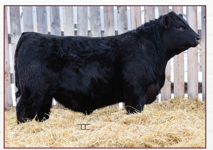
WARD'S C JUMP 45J