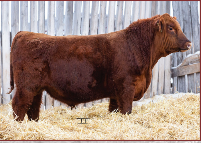
RED WARD'S CONTRABAND 27J