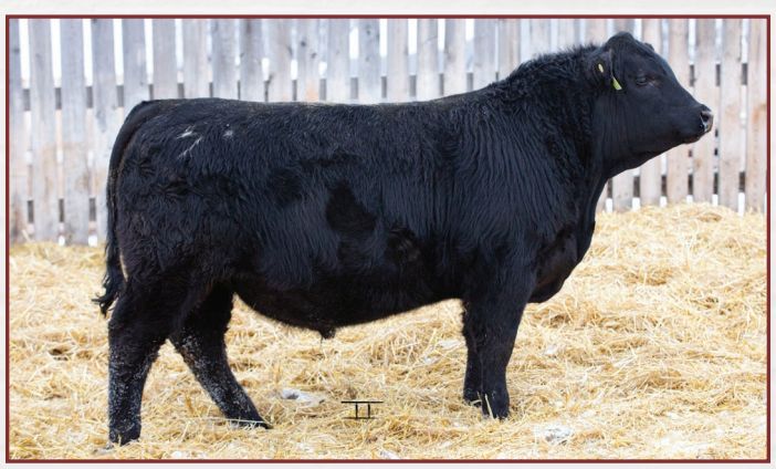
WARD'S C JAVA 4J