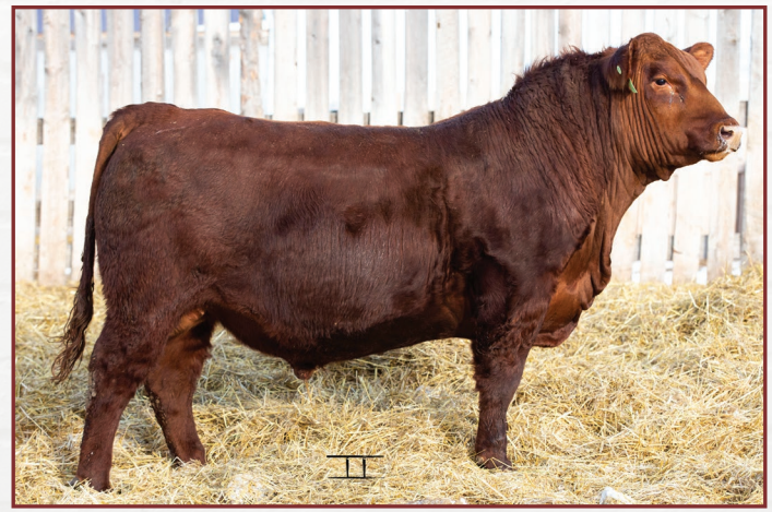
RED WARD'S SIGNATURE 2015H