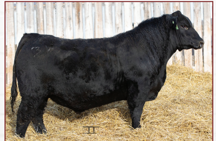
WARD'S ALASKA 2030H