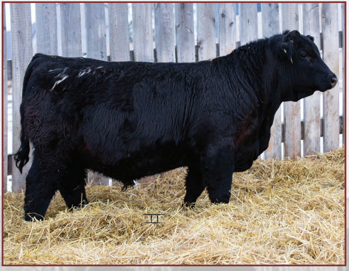
WARD'S C ALASKA 100J

· A maternal brother from last year sold to Thorpe's at Dinsmore.