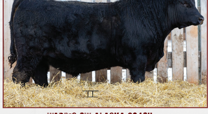
WARD'S CW ALASKA 2046H