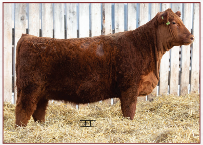
RED WARD'S PRIDE 56J