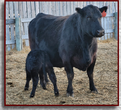
DAM 7Z AND 57J