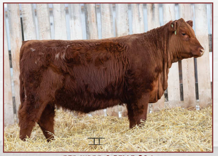
RED WARD'S BELLE 82J