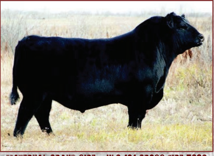
MATERNAL GRAND SIRE - HLC 101 CROSS FIRE 569C

• 8U is moderate made and dark in color, going back to the high selling Icon bull Red Letter Icon 1R that Alvin purchased in our 2006 Sale.