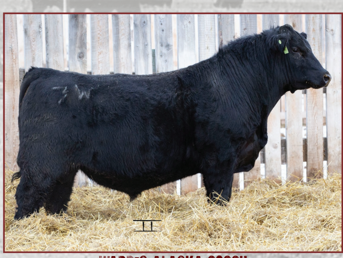
WARD'S ALASKA 2022H