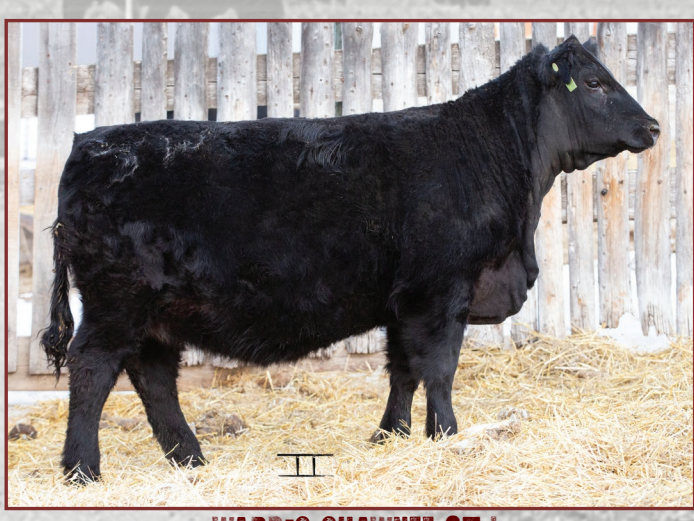
WARD'S SHAWNEE 87J

• We like the combo of the Capone Bull on the Alaska daughters.