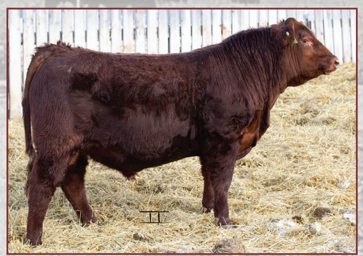
RED WARD'S SIGNATURE 2023H

EPD'S BW WW YW MM CE MCE 2.2 38 64 16 2.5 7.5