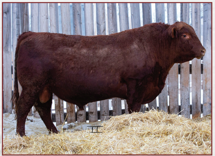
RED SELTE IRON MAN 827F

Iron Man impressed us as soon as he stepped off the trailer. His dark red color, natural thickness, muscle shape combined with the way he strides out on sound feet and legs is truly impressive. He has passed these traits onto his 1st calf crop. His calves average 80 lbs at birth with an average weaning weight of 728 lbs.