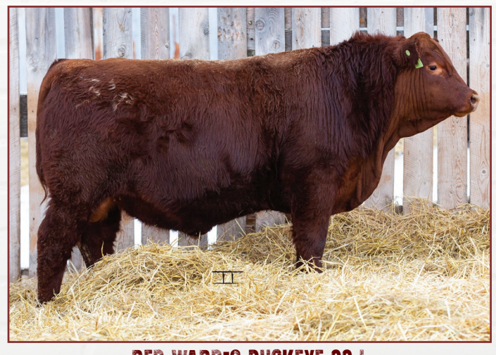
RED WARD'S BUCKEYE 33J