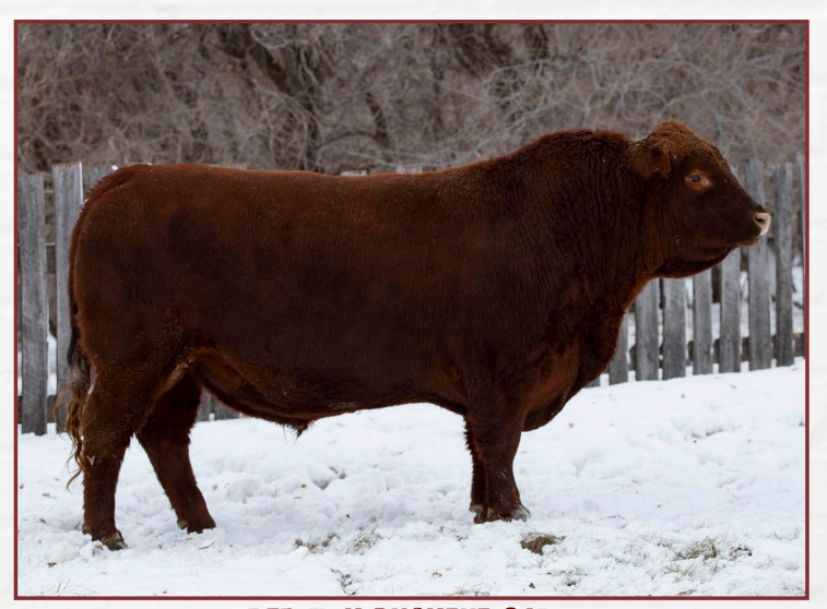
RED T-K BUCKEYE 81F

What a consistent group of Buckeye sons this year! This group of bull calves averaged 78 lbs at birth, with an average weaning weight of 715 lbs. Our Pen of 3 Buckeye bulls at Agribition had a 20 lbs difference, with a pen weight average of 984 lbs in November. Buckeye is proving to be a no-nonsense easy calving bull, with exceptional growth. He is a true curve bender.