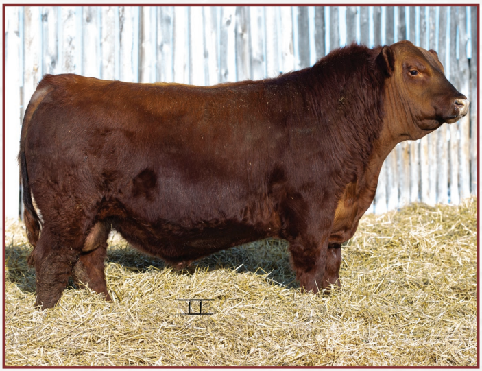
RED WARD'S SIGNATURE 2040H