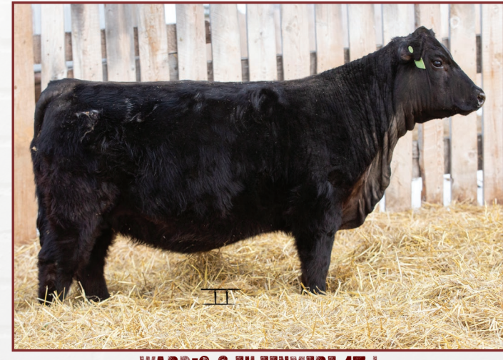
WARD'S C EILEENMERE 17J

• Check out Lots 57J and 78J, they show the production of this cow line.