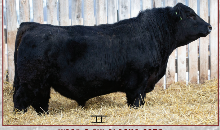
WARD'S CW ALASKA 2056