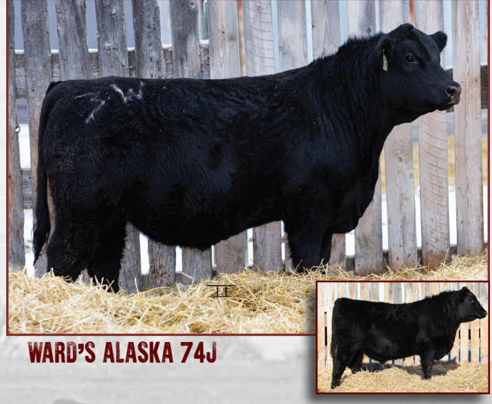
MATERNAL BROTHER 38H

• 74J is thick with an excellent growth rate, combined with his eye appeal, his calves will be money makers.