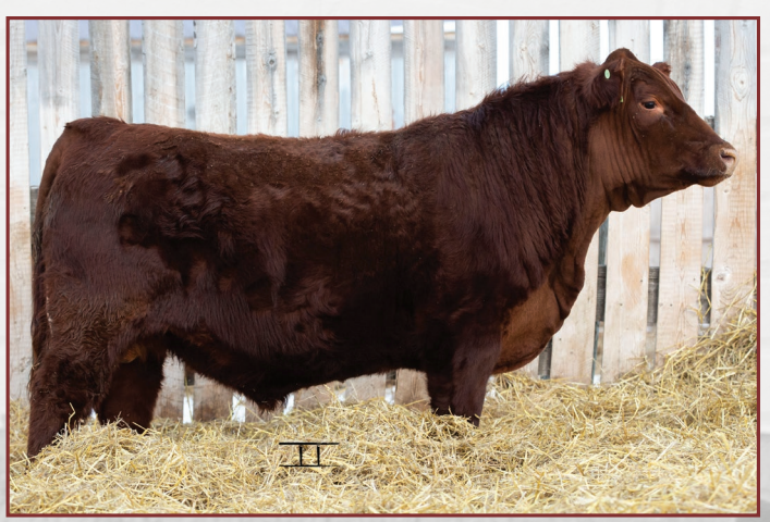
RED WARD'S SIGNATURE 2008H

As in past catalogues we do not put footnote's on the fall Bulls, If you have any questions please give us a call. Please note the weaning weights on these bulls are actuals! Both sires are known for there pay weight attributes!