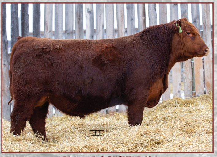
RED WARD'S BUCKEYE 13J

• This is 45D's 1st bull calf, her 2 previous heifers have been retained in herd