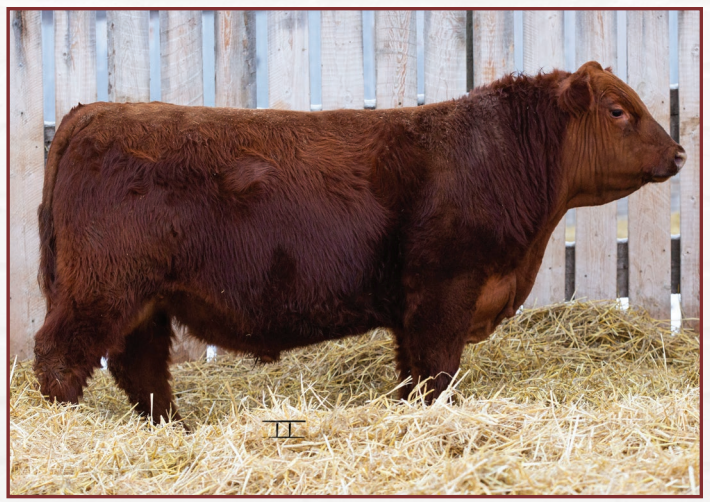
RED WARD'S BUCK 22J