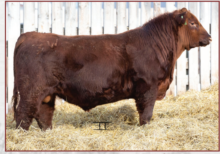
RED WARD'S SIGNATURE 2016H