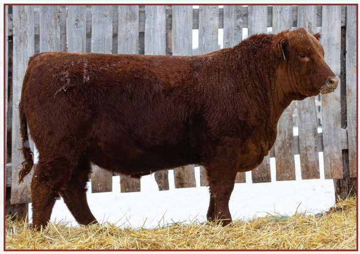
RED WARD'S C IRON MAN 8J