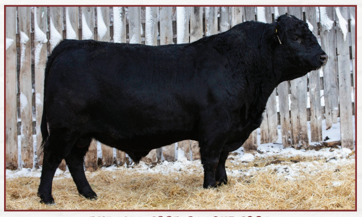
DURALTA 166D CAPONE 198F

• If you want a heavy group of calves in the fall, put this guy on your cows!