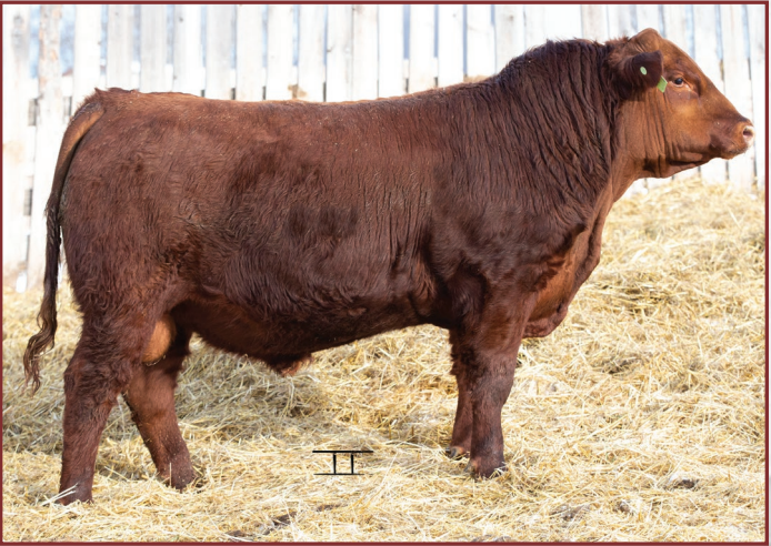
RED WARD'S HITCH 2048H